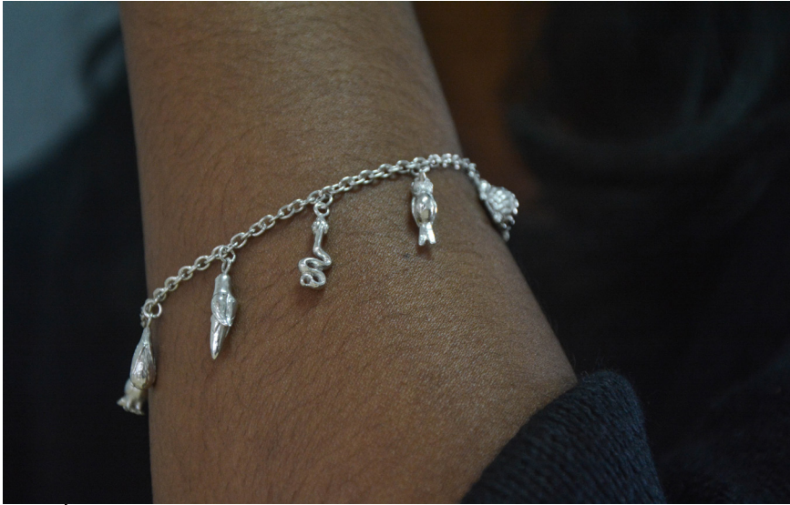
Silver Charm Bracelet Rs. 5400