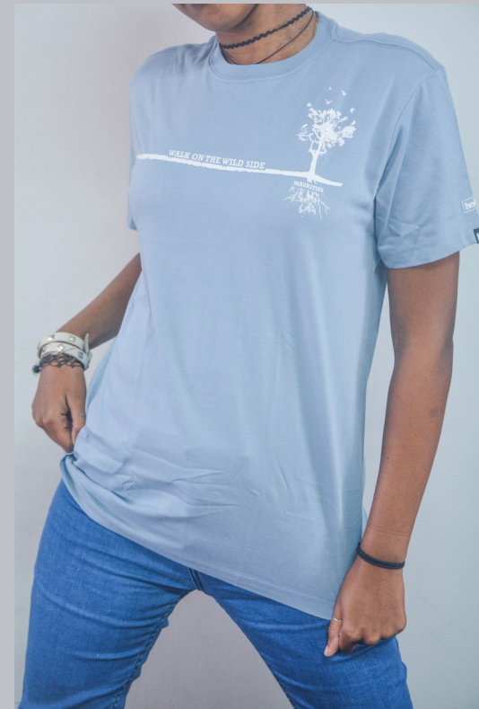
Rooted Tee Rs. 550

Available in different colours (Black, Brown, Blue and White)