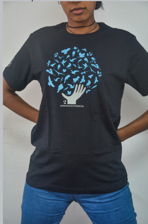
Home Tree Tee Rs. 550