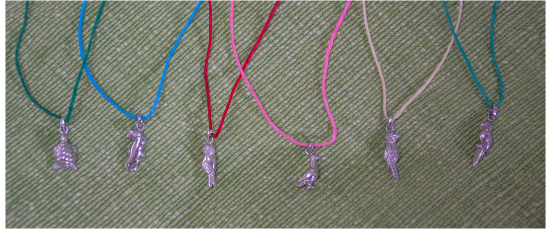
Silver Charm Pendant Rs. 1500