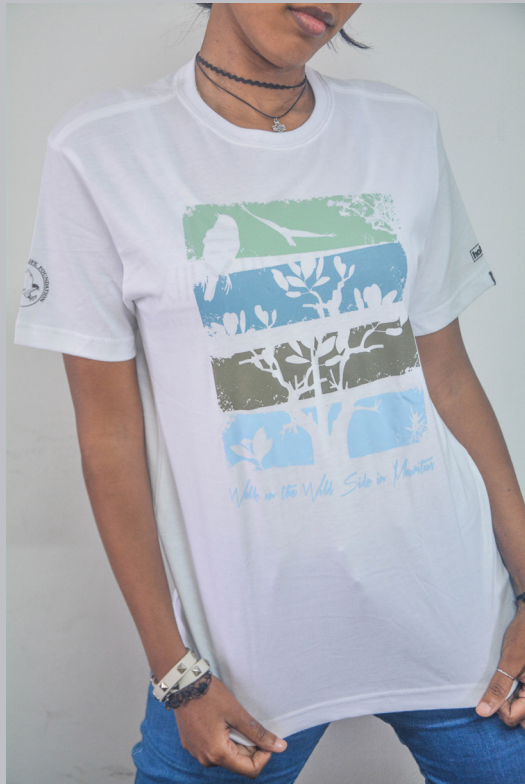
Habitat Tee Rs. 550