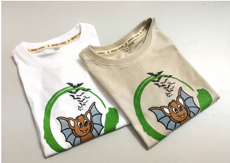
Bats Kids Tee Rs. 450