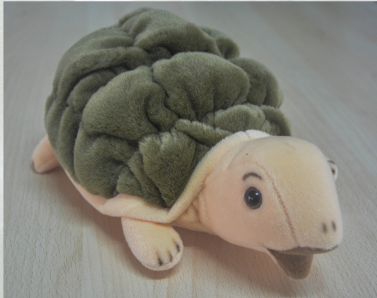
Tortoise Rs. 600 Size: 27 x 19 cm