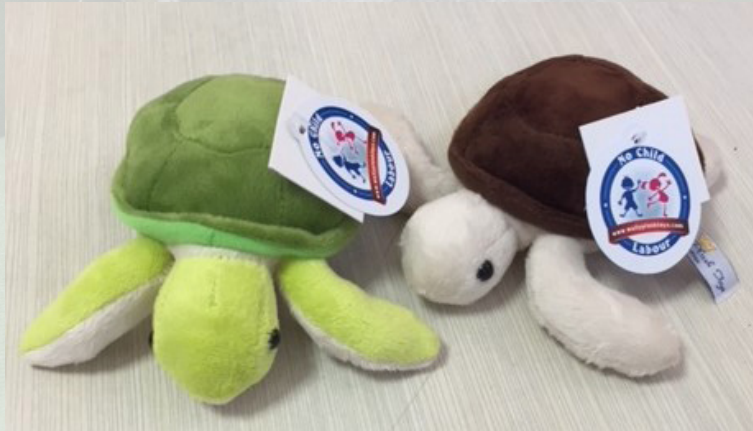
Tibo Rs. 325 Size: 17 x 17 cm