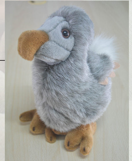
Dodo Rs. 600 Size: 19 x 22 cm