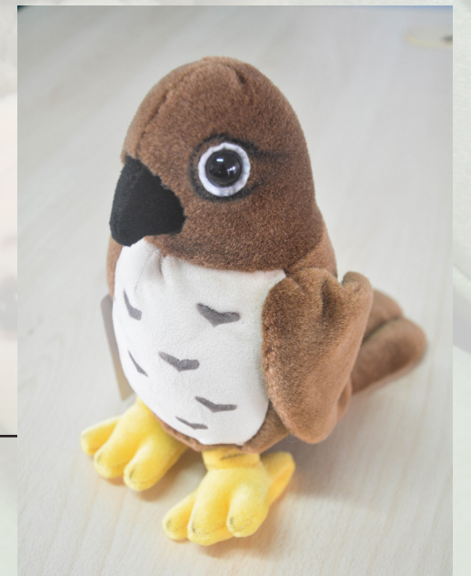
Kestrel Rs. 600 Size: 23 x 23 cm