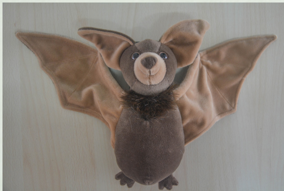
BAT Rs. 650 Size: 27 x 54 cm